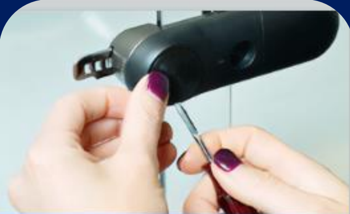
Parts & Repair